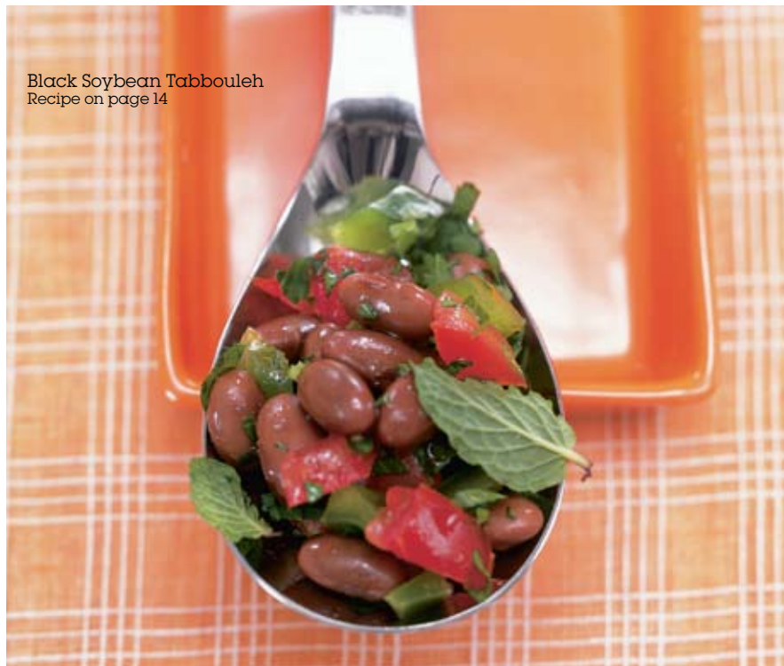
Black Soybean Tabbouleh Recipe on page 14